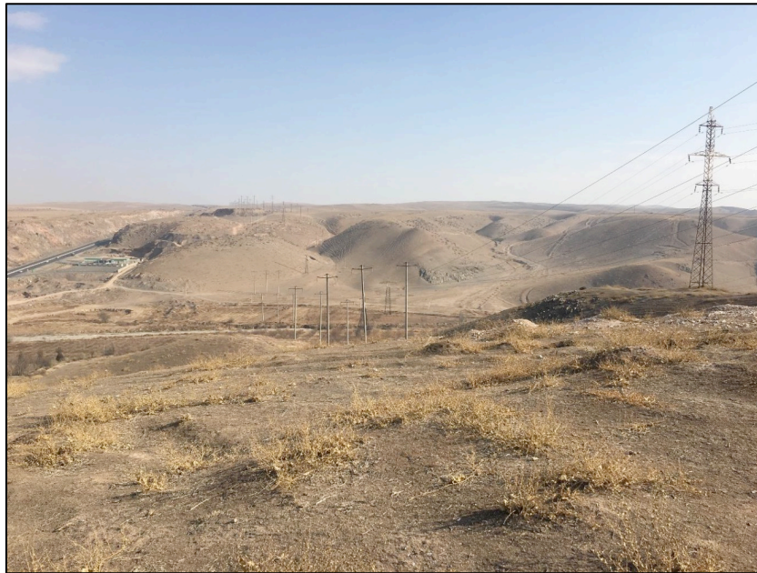
Plate 2. View across to the foothills for the Overhead Line between the Sanzar river valley and the existing Saribazar substation

Habitat typical of the Overhead Line are shown in Plate 2 .