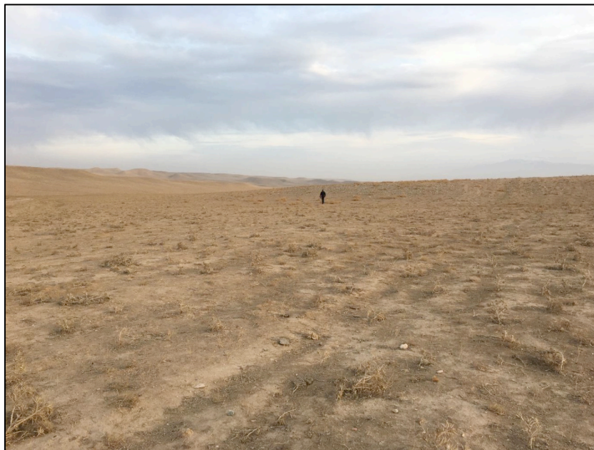
Plate 1. Fallow formerly cultivated land, the prevailing habitat type in the Solar PV Site. Historic plough-lines are visible and prevailing feature of the landscape within the Solar PV Site

The Overhead Line route crosses intensively cultivated and irrigated farmland habitat between the proposed Solar PV Site and the Sanzar river valley/Tashkent-Samarkand highway. To the south-east of the Sanzar River crossing, the Overhead Line traverses low lying foothills for approximately 1.5km